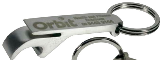
LL201s - B