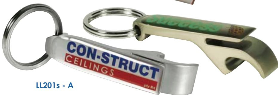
LL201s - A