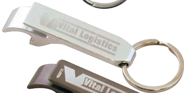
LL205s - B